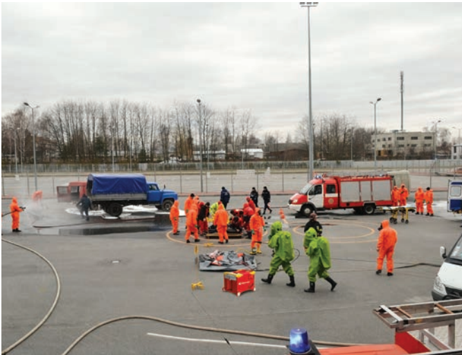
Fire fighters and emergency reponse