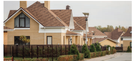
Private residential homes