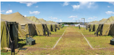
Temporary army bases